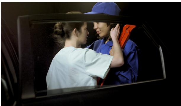
Simon Dybbroe Møller, What Do People Do All Day , 2020-22 © Simon Dybbroe Møller