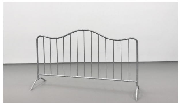
Tora Schultz, Control , 2022