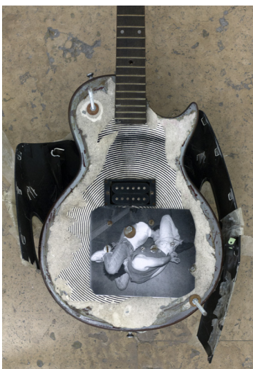
Rafael Moreno, A Bottoms' Poem , 2022