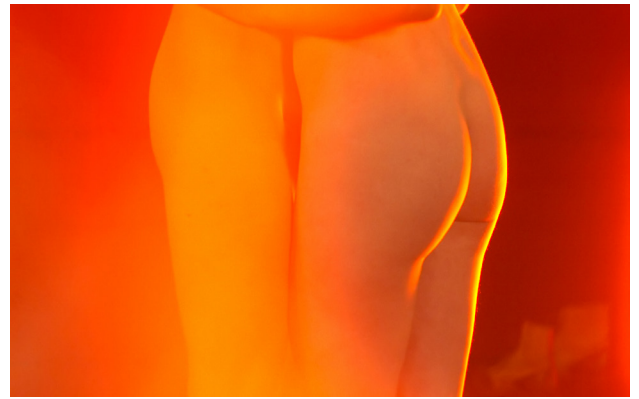
Simon Dybbroe Møller, What Do People Do All Day , 2020-22 © Simon Dybbroe Møller